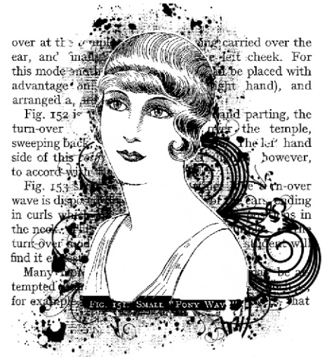
Vintage Style