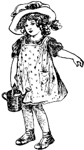
Girl with water can

Some examples of black and white line art are shown below: